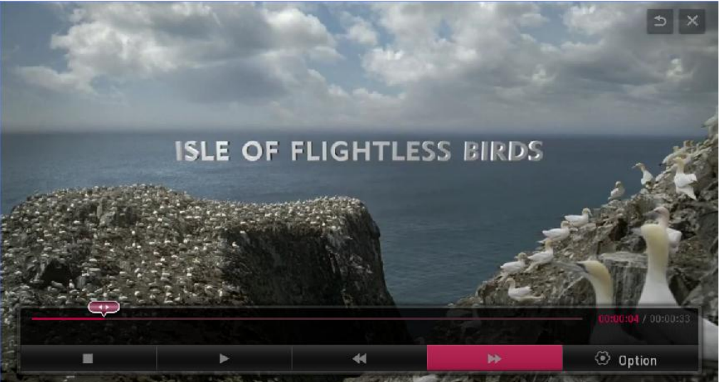
[Figure 3] WebAppSample___ HTML5 Video Player_Initial Screen